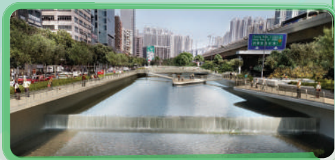
Smart Water Gate and Waterfall