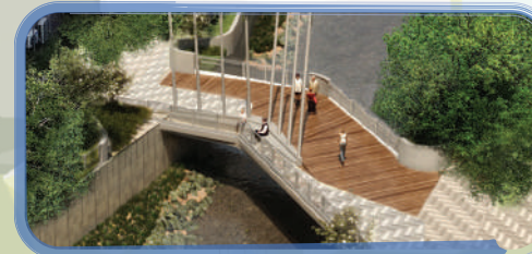
Cross River Walkway