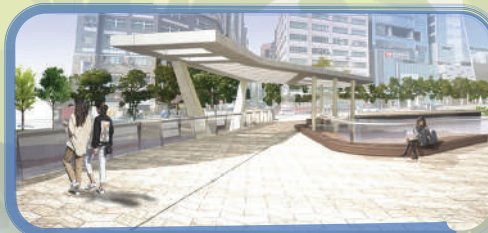
Cross River Walkway