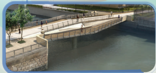
Cross River Walkway