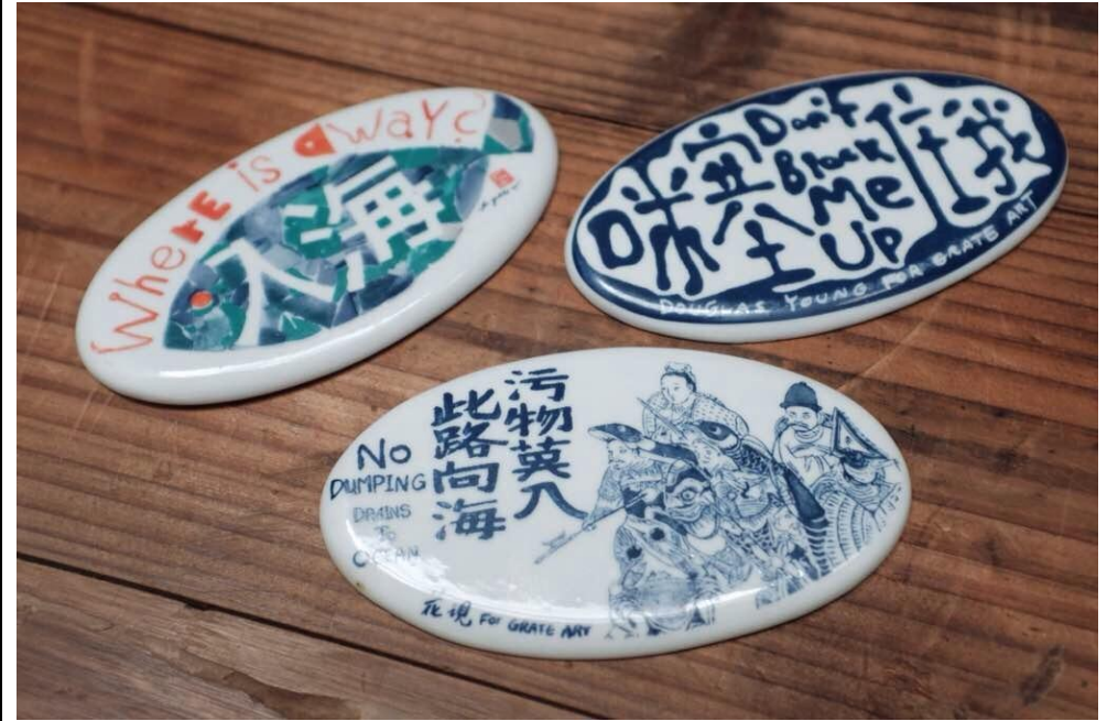
Examples from Grate Art plaques in the Southern District

Would You Like to be a Grate Art Artist? Help us Bring Colourful Street Art for Awareness to the Tsui Ping River Community's Pavement