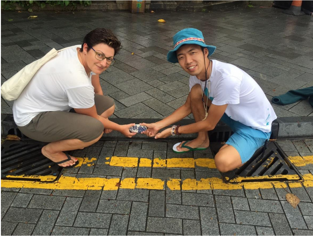
Volunteers are cementing the ceramic plaques in Southern District